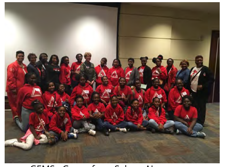
GEMS - Group from Selma, AL