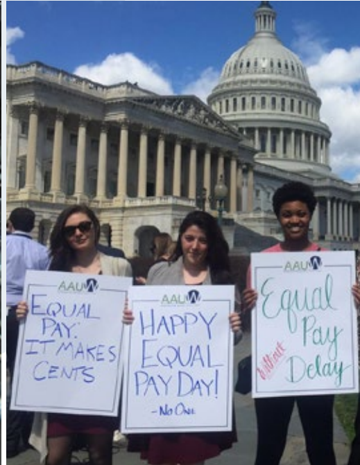
AAUW equal pay advocates on Capitol Hill