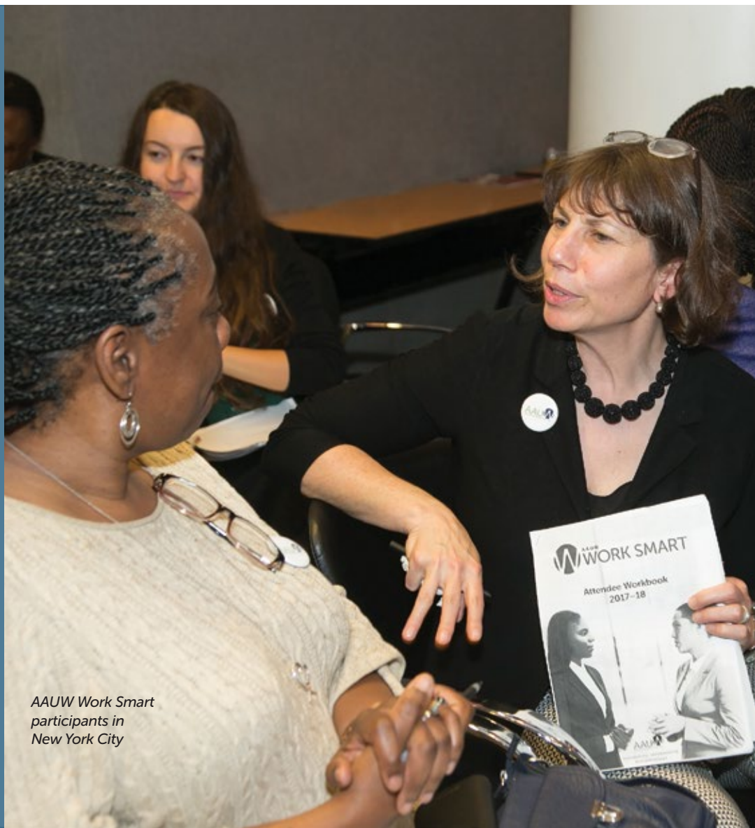
AAUW Work Smart participants in New York City