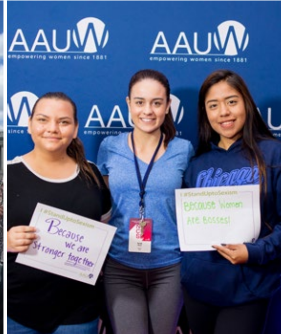
AAUW student leadership conference attendees